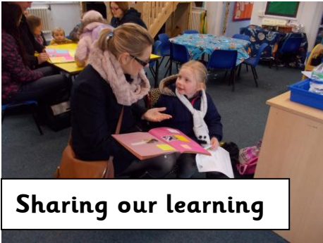
Sharing our learning