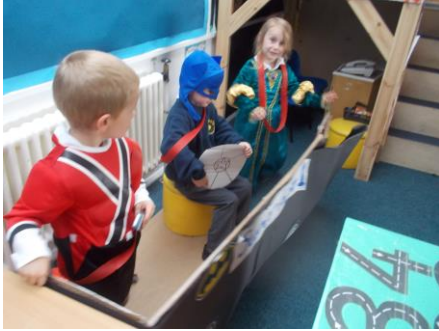
Working as a team